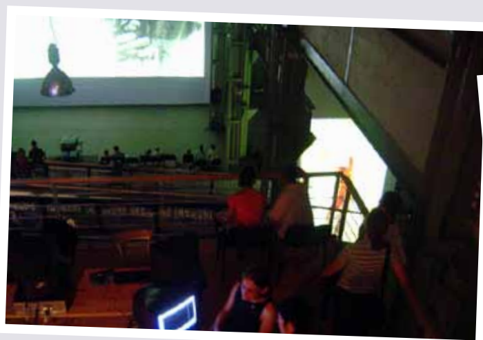
Animation on five floors: AniFest1 on Millenaris