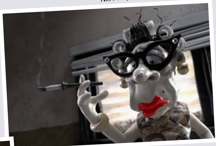
Oscar winning Adam Elliot's new feature opens Anilogue 2009