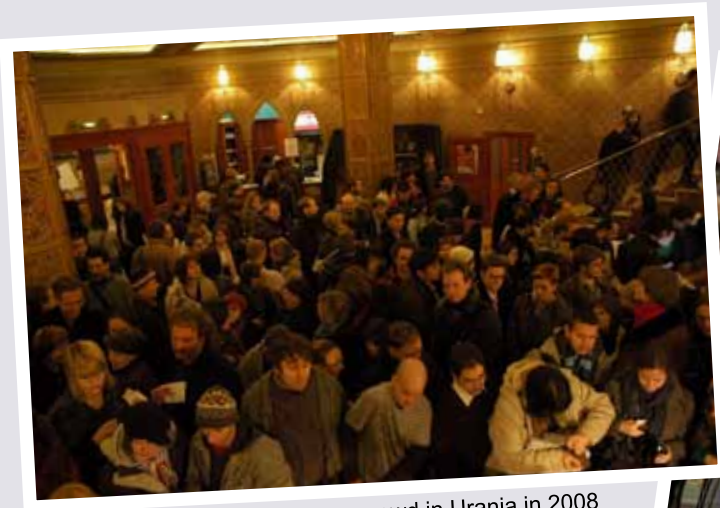
Opening ceremony crowd in Urania in 2008