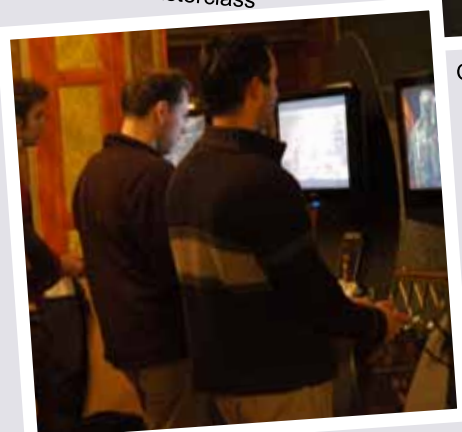
Electronic Arts game previews in the lobby